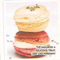
THE MACARON: A DELICIOUS TREAT, JUST LIKE PUREDKNY

The humble macaron has always been a culinary favourite. Perhaps it's the fact they're tricky to master or simply because they taste so delicious. L'atelier des Chefs ( atelierdeschefs.co.uk ), London's unique cookery school, aims to inject some serious fun into the creation of these sweet treats.