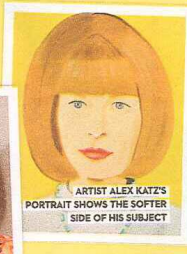
ARTIST ALEX KATZ'S PORTRAIT SHOWS THE SOFTER SIDE OF HIS SUBJECT