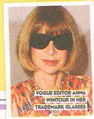
VOGUE EDITOR ANNA WINTOUR IN HER TRADEMARK GLASSES